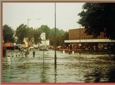
4. Much of the Green used to flood after heavy rain. This photograph from the 1970s shows what it looked like