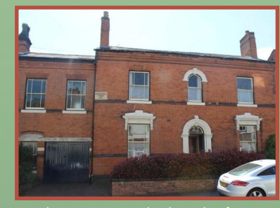
6. What reason might there be fo Baskerville House on the Avenue having such a name?