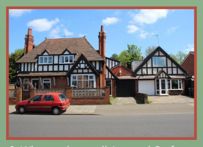
3. Why are the small Arts and Crafts style houses on Shirley Road there?