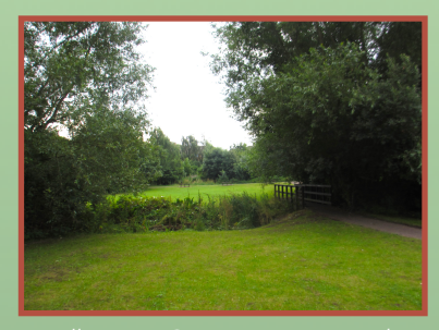
5. Millennium Green is an initiative by local people to provide an oasis of green space on former allotments

There are loads more hidden historical gems to be found in Acocks Green. Why not email us your stories a aghistsoc@hotmail.com?