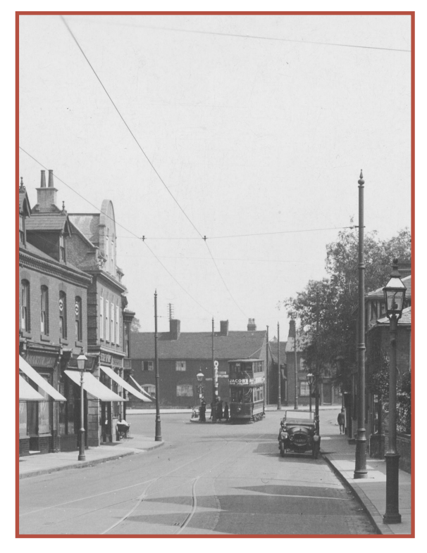
An early 1920s view of Acocks Green from near Dudley Park Road

This trail includes eight heritage information boards and pages on the Acocks Green History Society website.