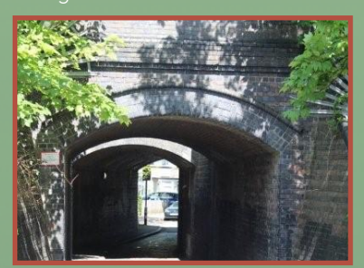
7. What is unusual about the railway bridge at Roberts Road?