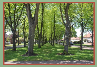
2. Why is Greenwood Avenue so wide?