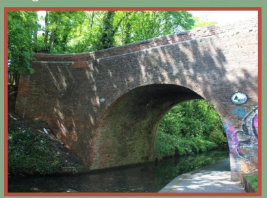
8. The canal bridge at Woodcock Lane is the only original one remaining in Birmingham on the Grand Union Canal, and is now statutorily listed.